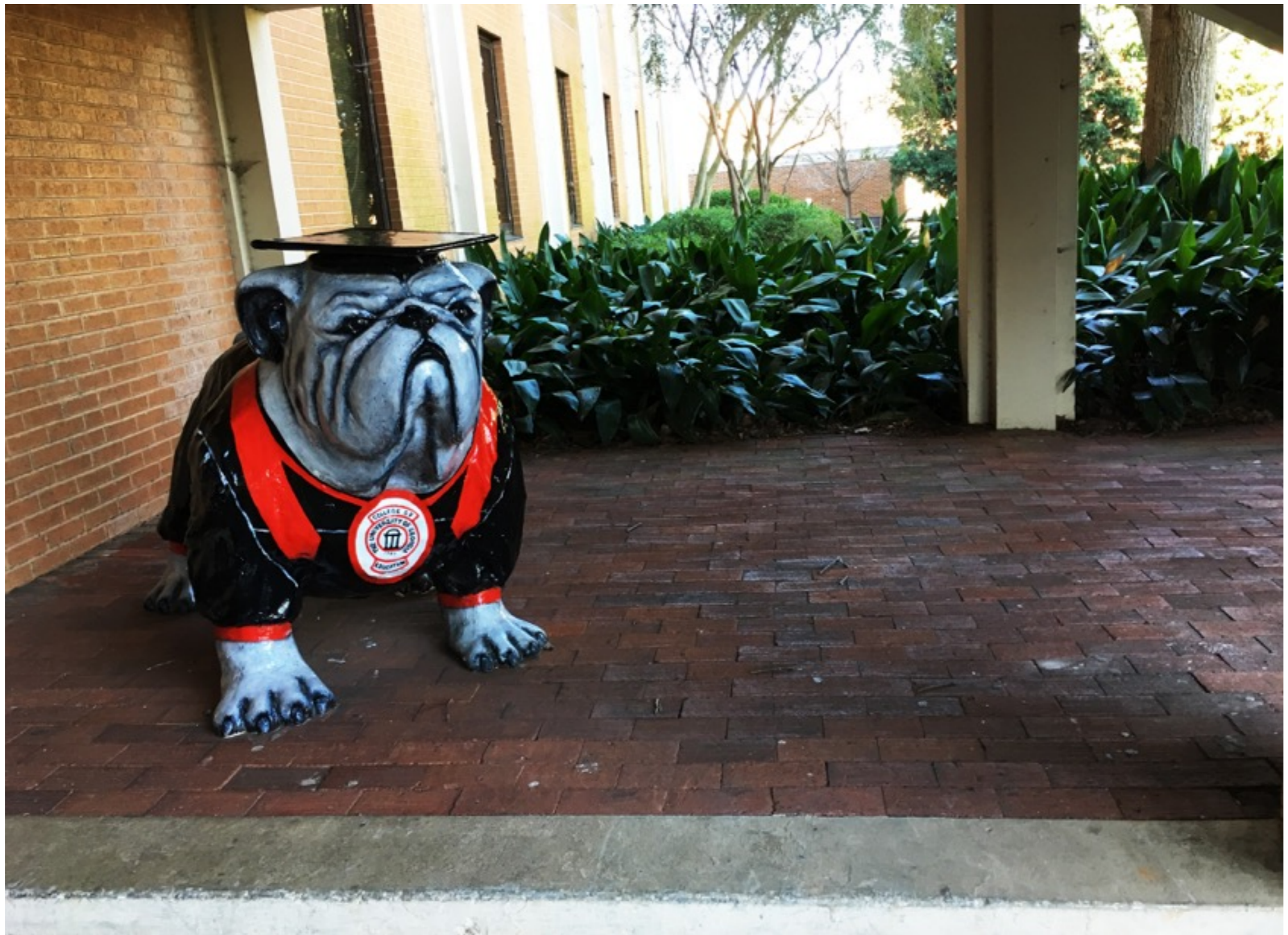
Rule of Thirds